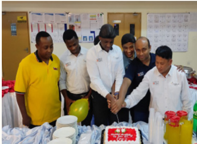
Al- Aqaria Project